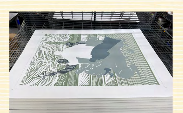
The making of the print edition at Modern Multiples

Original Linoleum Cut Design Element. The design was created with linoleum cut techniques, and then transferred to silkscreen for the final color printing.